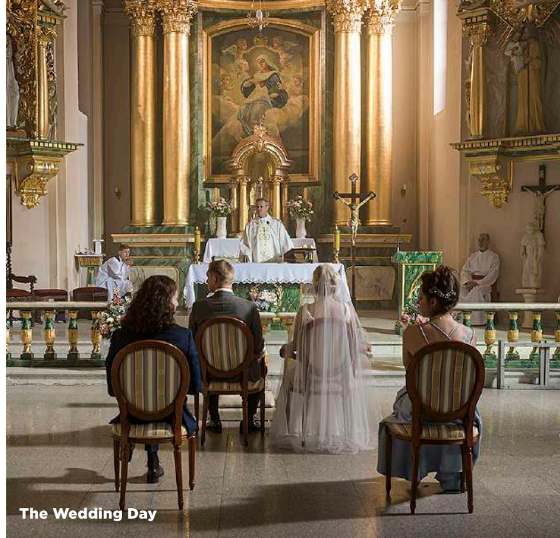
The Wedding Day

2021. 119 m. Wojciech Smarzowski. Menemsha Films. Poland. Polish with subtitles. NR.