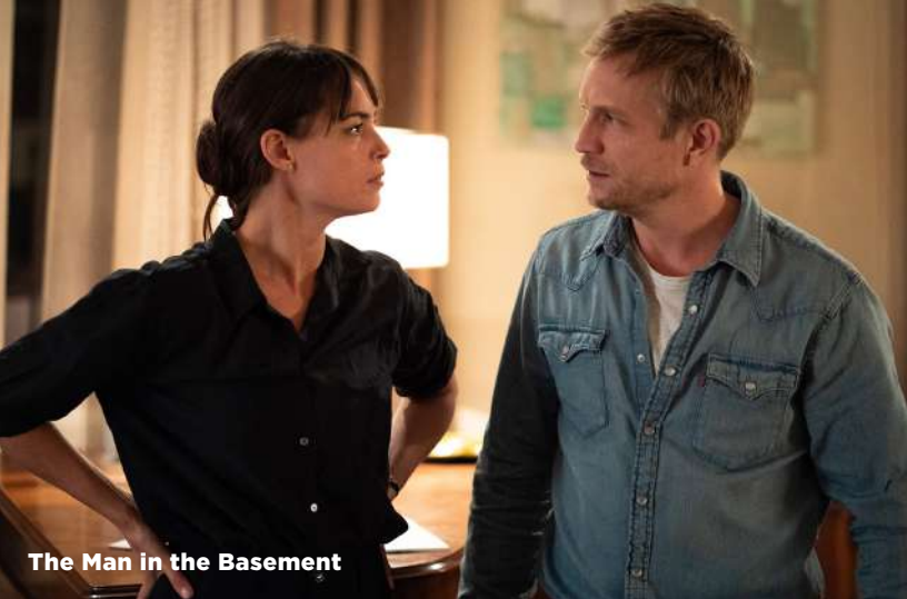
The Man in the Basement