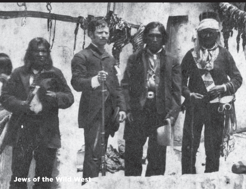
Jews of the Wild West