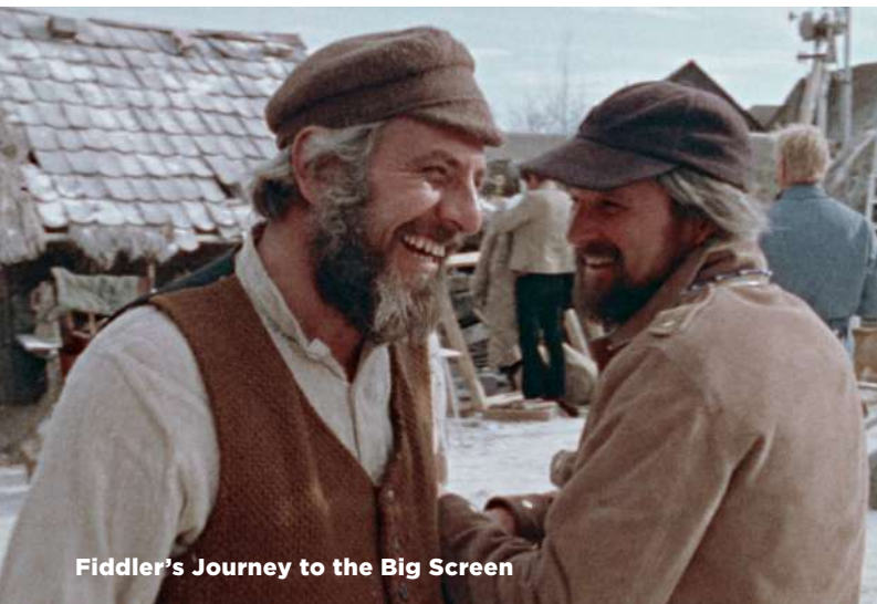
Fiddler's Journey to the Big Screen