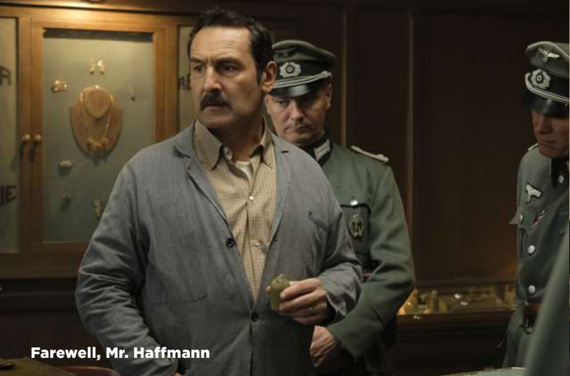
Farewell, Mr. Haffmann