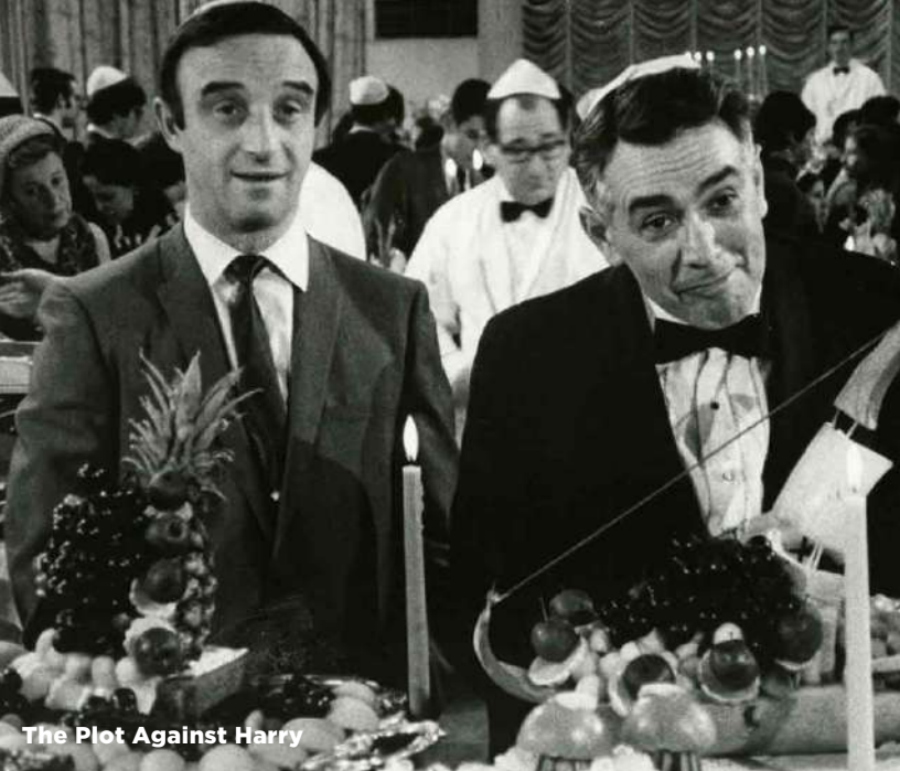
The Plot Against Harry